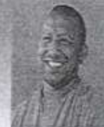
माननीय मुख्यमंत्री उत्तर प्रदेश

Postmatric otherthanInter Payment Status (2021-22)