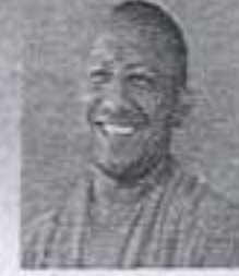
माननीय मुख्यमंत्री उत्तर प्रदेश

Postmatric otherthanInter Payment Status (2021-22)