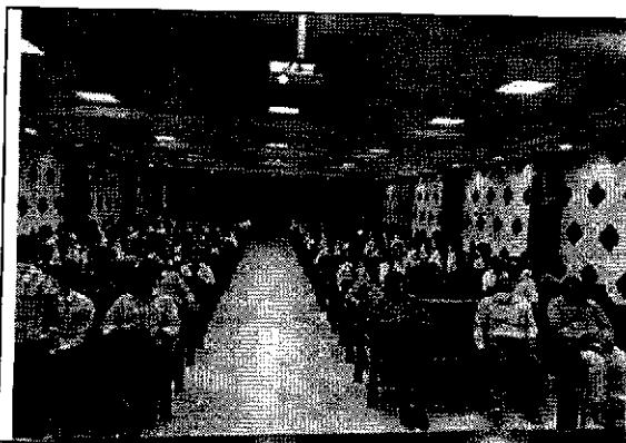
Workshop Session, 06-09-22

A total of 106 participants benefited from this event. The list of programs included in this event was inaugural session, talks by guest speakers, Q&A session summarization, concluding remarks, valedictory session and vote of thanks. At the end of the program the convener has taken the feedback from the participants and the key takeaways from the feedbacks from the participants are: Many participants noted that the workshop deepened their understanding of quality assurance in higher education, including the importance of accreditation processes and compliance with national and international standards. Participants found the discussion on curriculum development strategies highly valuable. They appreciated the focus on aligning curricula with industry requirements and emphasizing outcome-based education.