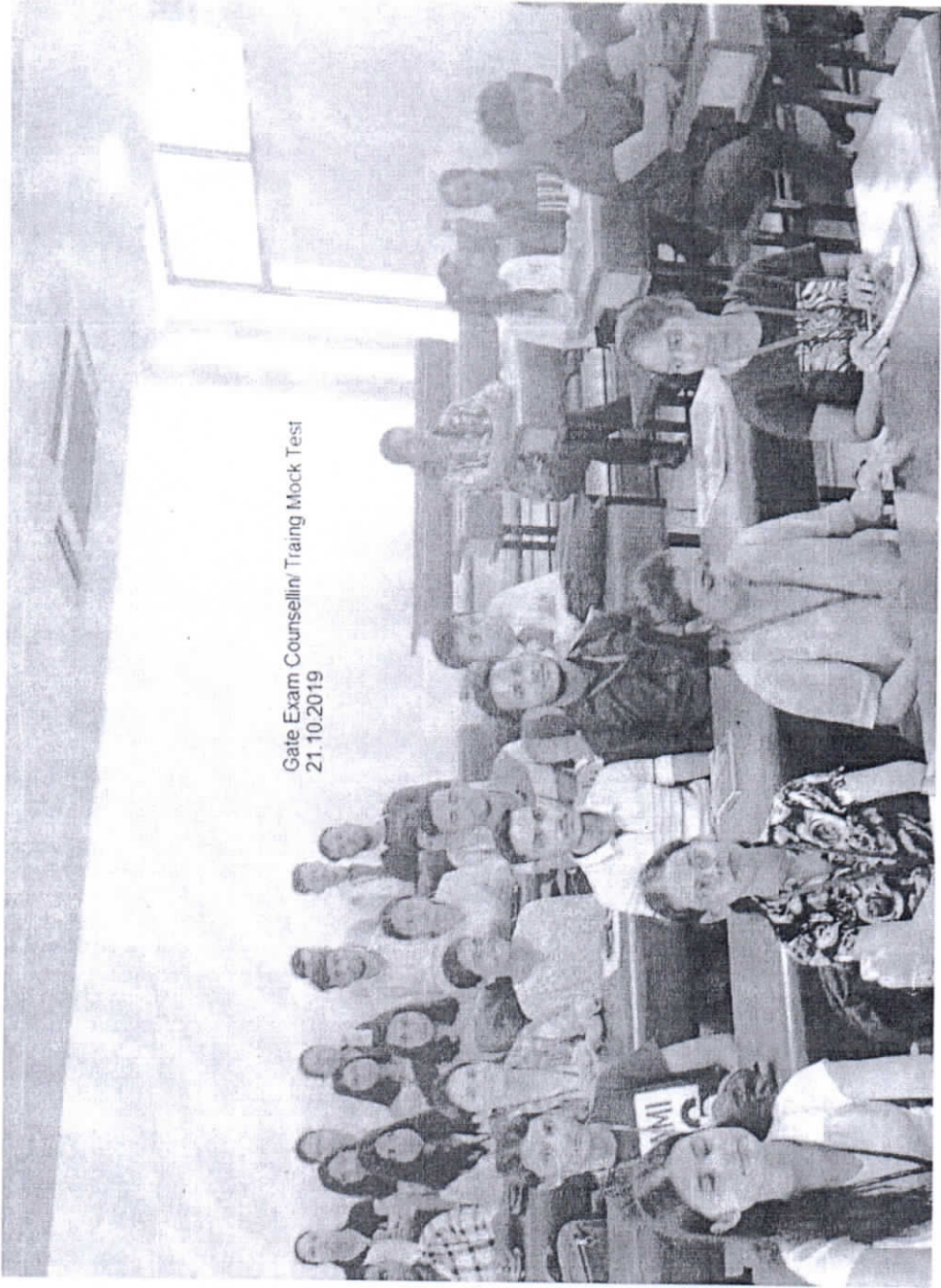
Gate Exam Counsellin/ Traing Mock Test 21.10.2019