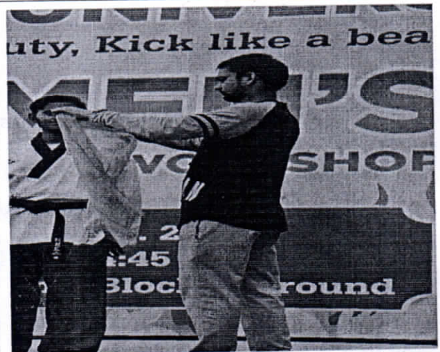
Instructor guiding students on how to untie the knot 12/12/2018