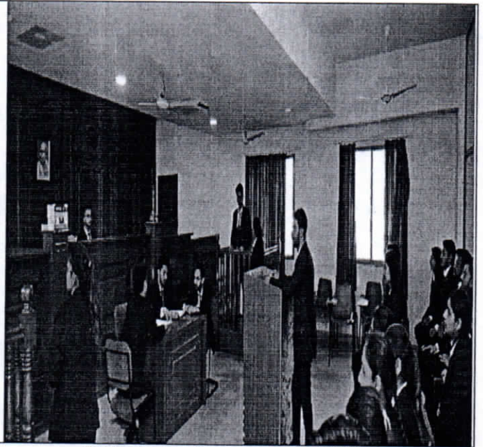
Students attending moot court 15/08/2018