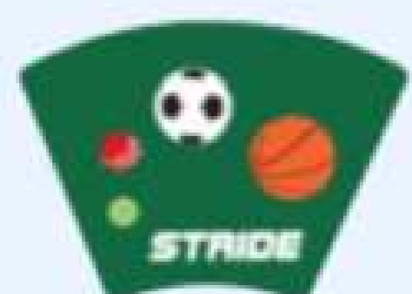
Stride The Sports Club

The pen is mightier than sword, only when it writes truthfull and thought- provoking sentences. A word can change, make or break the entire meaning of a sentence. This club emphasizes you to present your writing skills to bring a positive change by publishing your thoughts in our in-house magazine: Images.