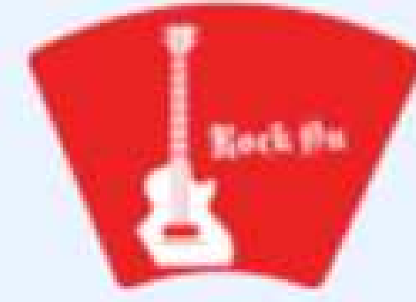
Rock On The Cultural Club

"Knowledge will only take you from A to Z, but imagination encircles the world", we stand by these words of Sir Albert Einstein; as to be an artist is to tame your imagination through creativity and this is what we believe in Panache. The club lets you make a statement for the love of fine art as in : painting, crafts, modelling, designing, print making or be it any form of creative endeavors that your artistic brain can wrap around.