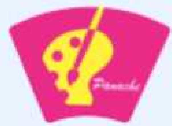
Panache The Arts Club

Abhiruchi comprise of seven clubs to encourage all the colors of the student personality like cultural, technical, sports, managerial etc.