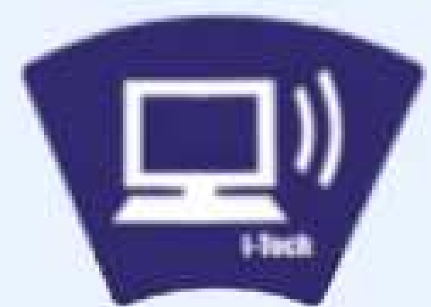
I-Tech The Technical Club

'Joy' a feeling of happiness can be depicted by singing and dancing. The club encourages your talents in the two forms and gives you a stage that is larger than life. Your skill in vocals and instruments are shaped by guidance of experts in both the areas of music and dance.