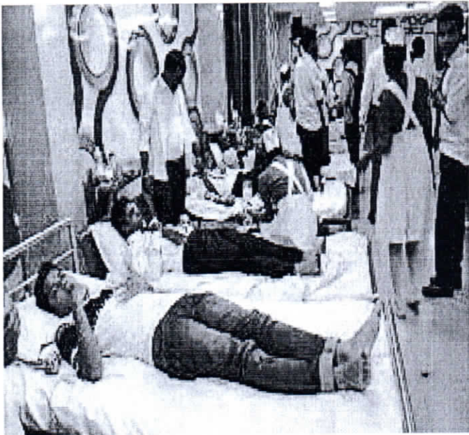
Volunteers while Donating Blood 23/07/2018

It was an extraordinary event that defied conventional limits. Through the profound dedication, unwavering enthusiasm, and boundless compassion, the Invertians breathed life into the hopes and dreams of countless individuals, endowing them with a renewed lease on life. This remarkable endeavor serves as a shining testament to the power of unity, empathy, and the valuable impact that a single act of kindness can have on the lives of many.