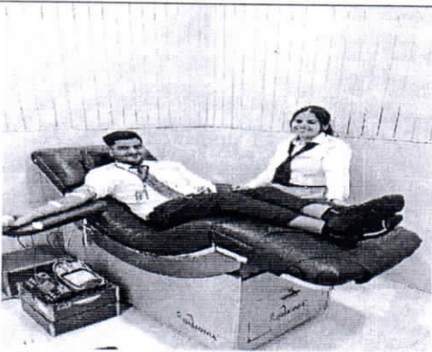
Student donating blood 27-03-2019