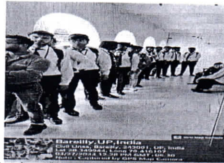
Students' lined up for registration 27-03-2019