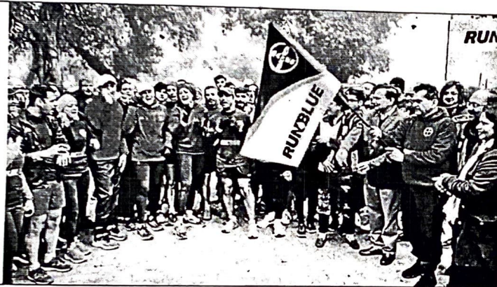
Volunteers and Student during the Nukkad Natak 31/03/2019

The Responsible Invertian club have organized one day save water awareness campaign in order to aware people of Bareilly regarding water preservation. The maino f the event is to ensure survival and improved outcomes for every child with safe and secure drinking water for all. A safe water supply is the backbone of a healthy economy, yet is woefully under prioritized, globally. It is estimated that waterborne diseases have an economic burden of approximately USD 600 million a year in India.