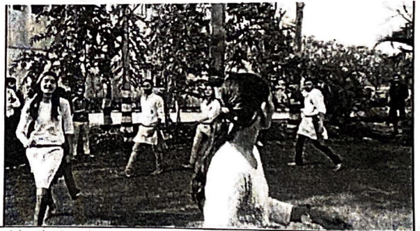
Nukkad Natak by BJMC students 22-3-2018