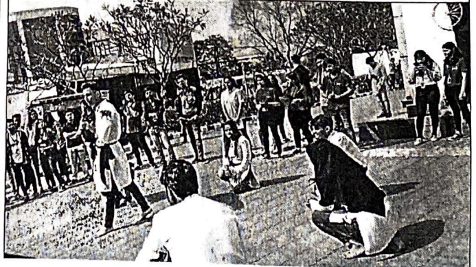
Nukkad Natak by BJMC students 22-3-2018