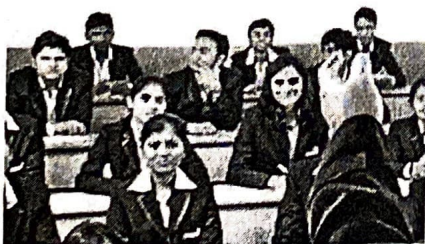
Group Discussion 22-3-2018