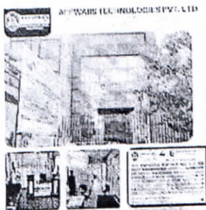
APPWARS Image.jpg 224K