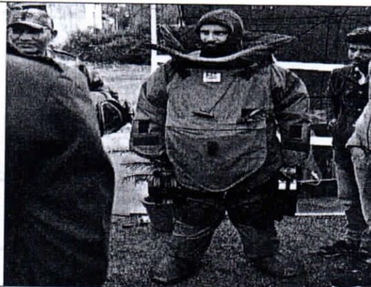
Ncc Officers in Weapon Show 24-01-2023