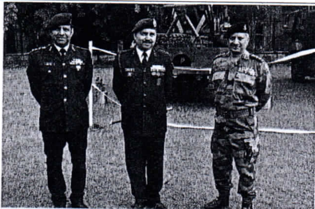
Ncc Officers in Weapon Show 24-01-2023