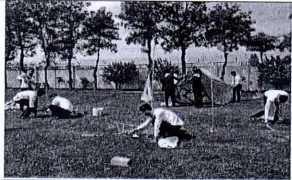
Preparation of event 25-02-2023