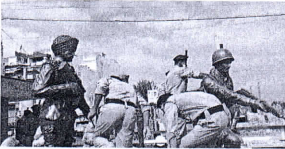
NCC Cadets showing Nukkad Natak 17-09-2022

The Cleanliness Drive conducted by the NCC unit adjoining Invertis University was a resounding success in promoting cleanliness, environmental awareness, and community engagement. The commitment and active participation of students, cadets, and local residents played a pivotal role in achieving the desired outcomes. I extend my gratitude to the NCC unit, school/college administration, and all participants for their dedication and enthusiasm in making this initiative a triumph.