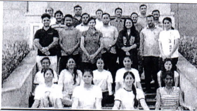
Students in Mental Health Session 10-10-2022

I would like to express my gratitude to the hospital staff, and all participants for their active involvement in making this program a success.