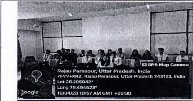
Students in Moot court 19-04-2023

Girls' education is not only a matter of fundamental human rights but also a crucial factor for social and economic development. This legal consultation highlights the importance of enforcing existing laws and policies, raising awareness, and addressing the systemic barriers that hinder girls' access to education. It is a collective responsibility to ensure that all girls have the opportunity to receive a quality education and fulfill their potential.