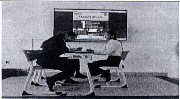
Students in Moot court 19-04-2023