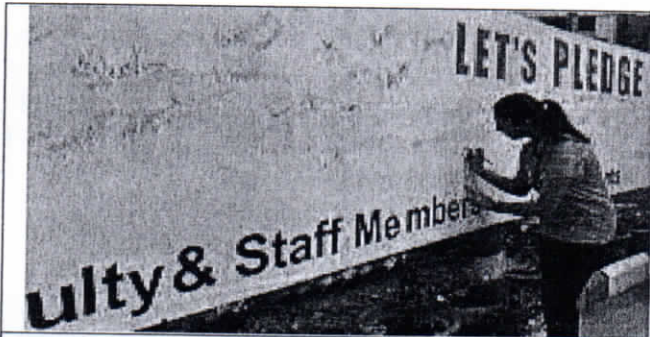
Student in Climate change campaign 25-12-2022

Conclusion: Climate change represents an urgent and complex challenge that demands immediate global action. While the impacts are already being felt, concerted efforts in mitigation and adaptation can help minimize the severity of future consequences. International cooperation, policy initiatives, technological innovation, and individual actions are all essential components of a comprehensive response to this unprecedented threat to our planet's well-being.