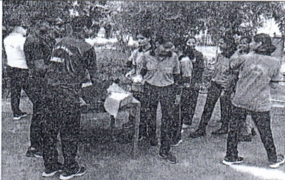
Students in Cleanliness drive in areas adjoining school and colleges 14-10-2022

The Cleanliness Drive conducted by the NCC unit adjoining Invertis University was a resounding success in promoting cleanliness, environmental awareness, and community engagement. The commitment and active participation of students, cadets, and local residents played a pivotal role in achieving the desired outcomes. I extend my gratitude to the NCC unit, school/college administration, and all participants for their dedication and enthusiasm in making this initiative a triumph.