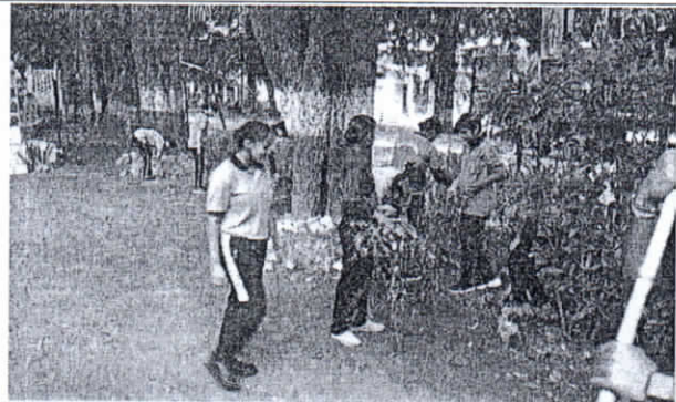
Students in Cleanliness drive in areas adjoining school and colleges 14-10-2022