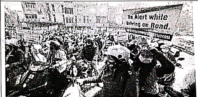
Students made a safety chart of Helmet Use on 25/12/2019