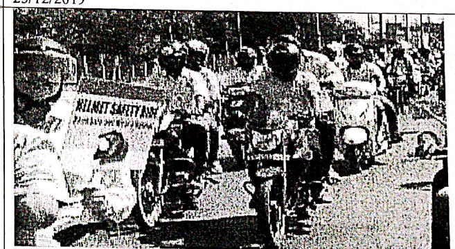
[Signature] Students made a safety chart of Helmet Use on 25/12/2019 Coordinator