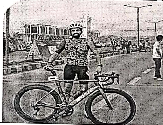
Student participating (05/July/2020)