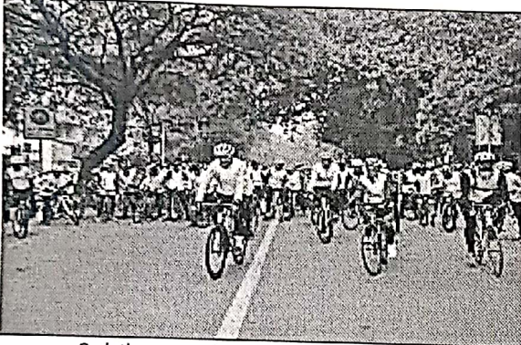
Cyclothan campaign starting point (05/July/2020)